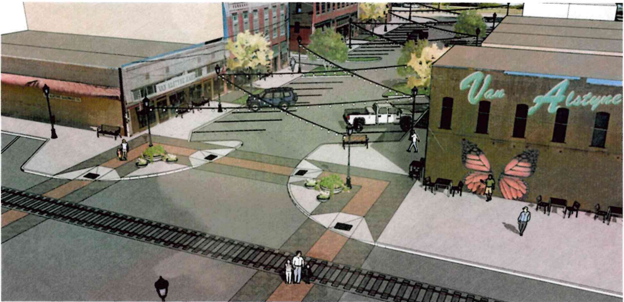
Conceptual Rendering – Westwood Professional Services, Inc. (intersection of Preston & Marshall)

paving of Preston Ave starting at Cooper St. heading south to Marshall St. The project will then turn east on Marshall St and pave Marshall to Main before turning north and paving Main St back to Jefferson. New concrete streets, curb and gutter, streetlights, park benchers, landscaping, overhead lighting and underground chase ways. While the renderings depict the railroad tracks on Preston Ave being stamped as they are in the Central Social District, the interurban tracks that are presently on Preston Ave will be saved and reused.